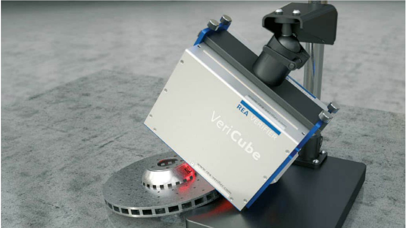
Stand solution for code verification on 3D objects