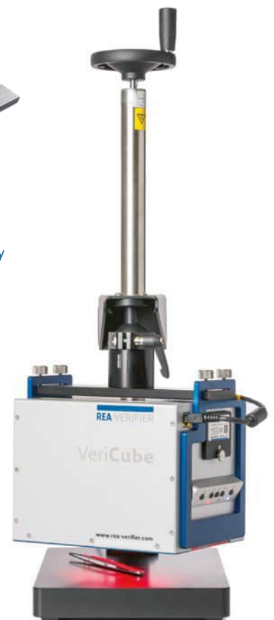
Verification of tweezers

REA VeriCube with diffuser. The distance adapter is required for adjustment and calibration. It can also be used for measuring folding boxes or labels