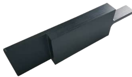
REA VeriCube parallel underlay as distance gauge

REA VeriCube with diffuser. The distance adapter is required for adjustment and calibration. It can also be used for measuring folding boxes or labels