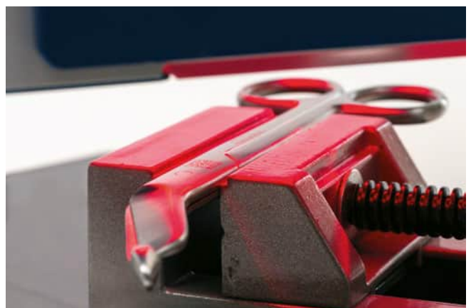
Verification of surgical instruments