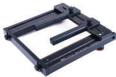
View from above: REA VeriCube Positioning Aid