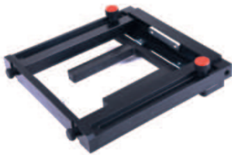
View from below: Fast mounting of positioning aid

The positioning aid is printed with a scale. This makes it easy to document and adjust positions for different packaging materials.